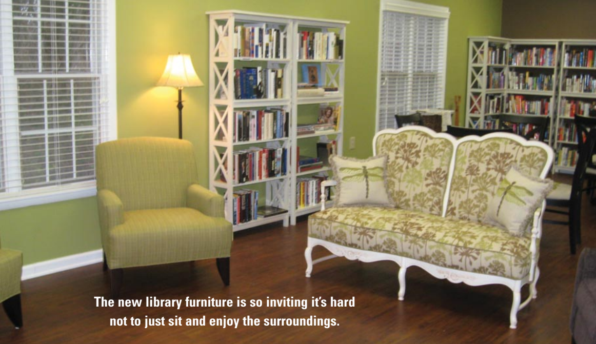
The new library furniture is so inviting it's hard not to just sit and enjoy the surroundings.