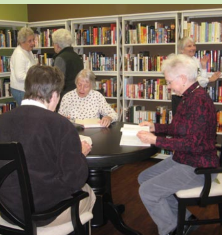
These ladies enjoy reading and sharing their book recommendations.

complete renovation – funded by a grant from the United Church Homes & Services Foundation. Volunteer residents worked diligently restoring the renovated library to full working capacity. Updated shelving and lighting showcase the books, while a welcome area greets residents and guests. Whether a resident wants to sit quietly and read, or work at one of the nearby tables, the newly renovated Library has a perfect spot.